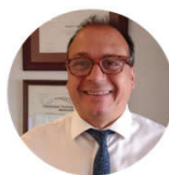
César Sivo Persons Prize